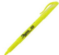
1 highlighter (yellow only)