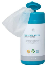
1 or 2 container wipes