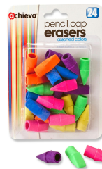
pencil cap erasers (2 packs)