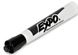
dry erase markers (black only)