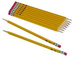
1 pack 20 yellow pencils (NO mechanical)