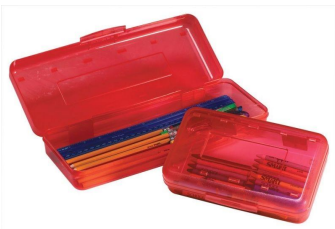
1 pencil box