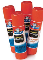
glue sticks (3 pack)